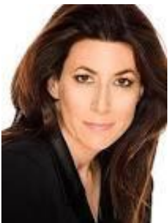
Political commentator Tammy Bruce , writing on failure and chaos with bail reform in New York in "The Washington Times":

"While the nation has been distracted by Democrats in Washington as they try to remove a duly-elected president from his office, that same political party continues to put its stamp of chaos on the city and state of New